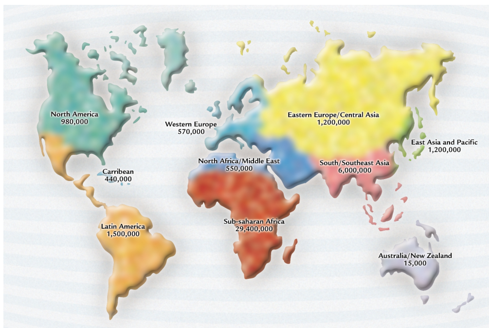
Figure 1 People estimated to be living with HIV/AIDS as of the end of 2002.

approved by all 146 members of the organization (including 53 developing countries) after an impassioned plea by representatives from African nations to stop the bickering over details and to move the legislation forward. Under the latest provisions, the overriding of patents and the importation of generic drugs must be undertaken by a country only “in good faith to protect public health” and must “not be an instrument to pursue industrial or commercial policy objectives.” The new agreement also calls for special packaging or differently colored tablets to be used for generics, to prevent their resale in wealthy nations.